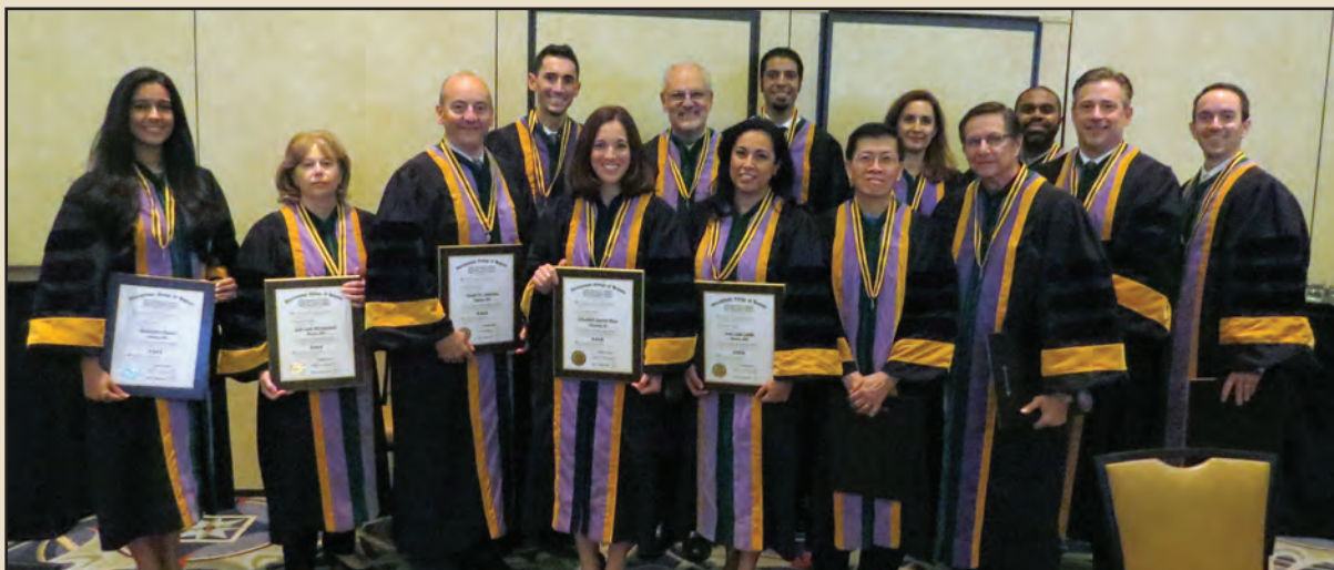
District One New Fellows