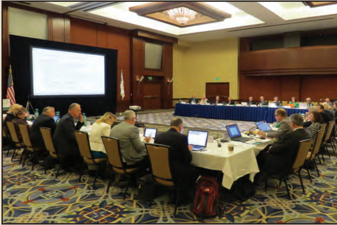
Board of Regents at work